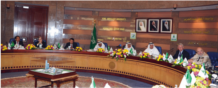
Photo of the 1st KAU International Advisory Board meeting held on KAU Main Campus

Such a role as an internationalization portal has major implications for KAU. This can be seen as one of the driving forces that led the university to establish the IAB. It is also an important driving force behind the establishment of KAU's first two strategic plans and the current preparation of the third strategic plan. Indirectly, it provides part of the impetus that the university leadership has drawn on to enhance KAU's international reputation that has resulted in increasingly higher international rankings.