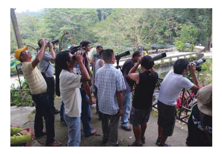
Fig. 12.6 Tourists viewing formerly hunted fruit bats at their protected roost site in Mambukal Resort, Negros Occidental, Philippines

Bat conservation through roost protection by local communities has been demonstrated to be effective for the recovery of previously declining populations (Mildenstein 2012; Fig. 12.6). The adoption of such roost protection programs in other countries could hold the key to sustaining populations. This is especially true for areas where fruit bat hunting is intense. If successful roost site protection programs could be demonstrated and published, these could be used as models for other areas (e.g. P. rufus populations in Madagascar—M. Ralisata pers. comm.; P. vampyrus in Malaysia, M. Gumal, pers. comm.; P. vampyrus and A. jubatus populations in the Philippines, SOS 2012).