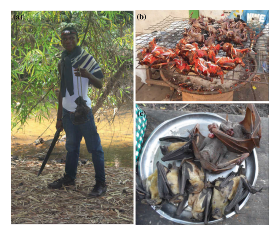
Fig. 12.1 Collection and sales of bats in Africa a R. aegyptiacus collected by a hunter with sticks from a limestone cave in Etapkini near Calabar, Nigeria, b Fruit bat kebab on sale in Kumasi, Ghana, c E. helvum and H. monstrosus on sale in a small market by the River Congo in Kisangani, DRC