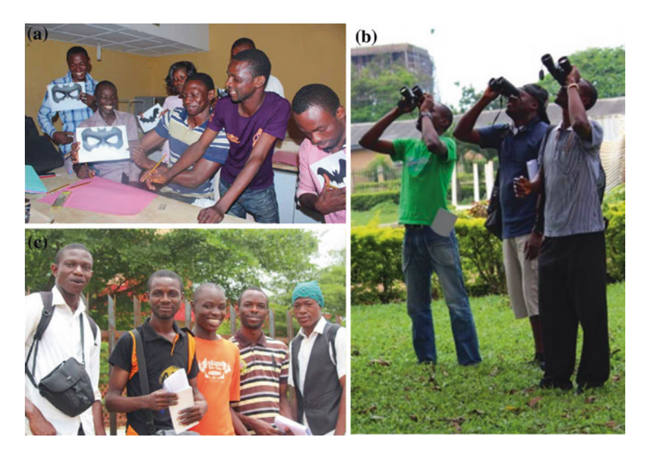
Fig. 12.3 Conservation education and bat population monitoring by volunteers in Eidolon Monitoring Network in Benin City, Nigeria, school students engage in conservation outreach event, a volunteers prepare conservation outreach materials, b volunteers counting straw-coloured fruit bats Eidolon helvum at King square, Ring Road, Benin City, c undergraduate student volunteers Eidolon Population Monitoring team from University of Benin, Benin City, Nigeria

Education and awareness programs . One of the most hunted bats in sub-Saharan Africa, E. helvum is the focus of members of the Eidolon Monitoring Network (EMN) who conduct education activities in areas near bat colonies (J. Fahr, pers. comm.). In Kenya and Nigeria, scientists and volunteers of the EMN carry out education programs in schools (Fig. 12.3) and among the general public (Tanshi et al. 2013). Education on islands around Africa has proven effective in drawing local attention to bat protection. Examples include the recovery program