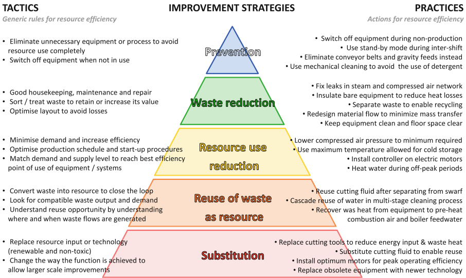
Fig. 3. Improvement strategies, tactics and examples of practices for sustainable manufacturing

Further learning about good practices can be done through analysing documented cases [10] and databases [11] of best practices. Those information sources may be overwhelming as they contain a large number of examples and thus it is challenging to find specific, relevant information for a given company [12]. To simplify access to examples of sustainable manufacturing practices (step 6), a list of strategies and tactics [13] have been developed to support effective learning and ease access to specific solutions (Fig. 3).