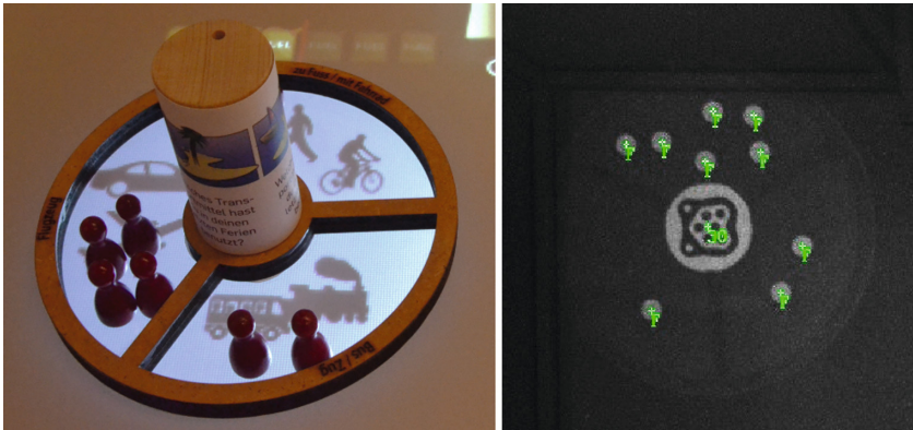
Fig. 2. The final design of the Tangible Voting widget (left); detection via reactIVision (right).

working with features a marker, we chose to align the different input zones in a circular manner with the marker hidden in their centre (see Fig. 2 left). This makes the widget resemble a pie chart. We used a diameter of 15 cm and three zones. The enclosing is physical, with its bottom supported by a thin transparent plastic film to allow users to lift, drop, and reposition the widget without impacting votes that have already been cast. We embedded the widget label indicating the question on a flat, vertical board (third prototype) first, then on a cylinder placed in the centre of the widget (fourth prototype). The rationale was that such a 3D label may facilitate reading the text from a lower perspective and be memorized more easily compared to a flat, horizontal label.