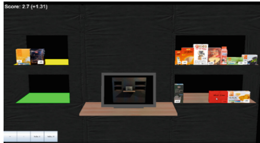
Fig. 4. Setup in the virtual world condition

Virtual Environment. We designed the virtual world to be as similar as possible to the real world in order to ensure comparability. Therefore we decided against a 2D representation and used a 3D view instead. A screenshot of the virtual model is shown in Fig. 4. For additional functions such as switching views between shelves or zooming, several command buttons are displayed in the lower left corner of the interface.