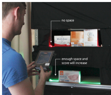
Fig. 3. Lights indicate available space and score

Real Environment. The subject uses real products and shelves to accomplish the task. We implemented several assistance systems, which should help the subject in achieving a good score, without reducing the cognitive effort too much. We displayed the actual score as well as the change with respect to the last step on the screen between the shelves, giving the subject an idea of whether his actions were going in the right direction. Additionally, we installed LED lights in different colors on each shelf of the left shelf unit (target shelf). As soon as the subject touches a product or holds it in his hands, the LEDs are turned on, indicating if there is not enough space to place the product (red light); there is enough space, but the score would decrease (yellow light); or there is enough space and the score would increase (green light) after placing the product (see Fig. 3).