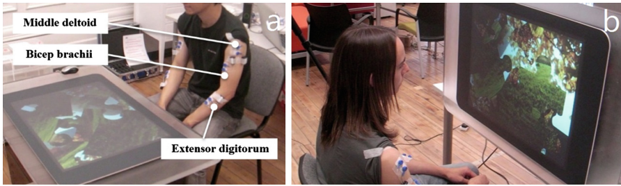
Fig. 1. The experimental set up for the horizontal (a) and vertical (b) configurations

the task as the possible interaction techniques were described verbally. They were then asked to wait for the start and the end of the session to be announced. During the session, ten electromyograms (EMG) were recorded for muscle activity analysis. Participants were all males to limit interferences due to anatomical differences [15].