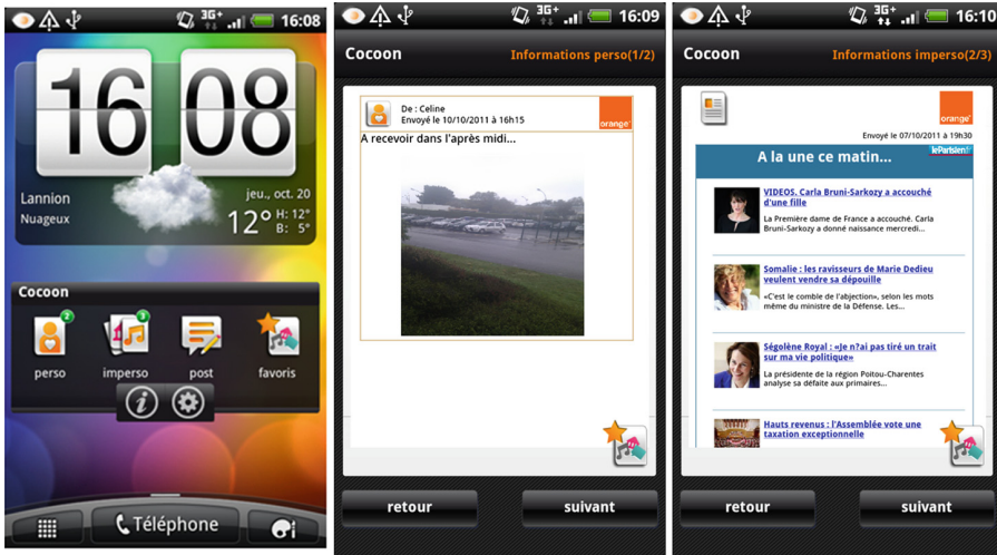
Fig. 2. Cocoon on the HTC Desire S: on the left, the Cocoon widget on the Smartphone home screen; in the middle, a post; on the right, a page of information related to news.