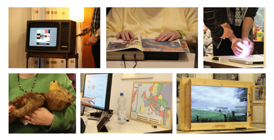
Fig. 2. Probes: Top row, left to right: Chrono TV with TV programs sorted by decade, Interactive Book with sound output based on opened page, Icho-Sphere reacting to user's touch. Bottom row, left to right: Music-Teddy playing songs from the 30 s when lifted, Reminiscence Map with users' stories linked to time and place, Memory Window with scenes of familiar places.

professionals followed by a design iteration that focused on improving the content, aesthetics and interaction. (For detailed information about the design and implementation of a single artifact, see e.g. our previous publication on the Reminiscence Map [13]). The probes cover a range of interaction styles as well as media content ranging from public material to completely personal stories.