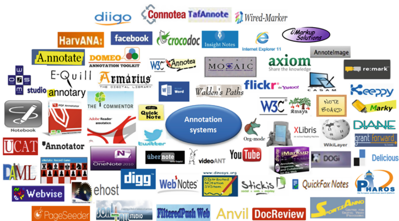
Fig. 1. Several annotation systems are developed in different contexts.

Annotation systems have been developed since the 90 th to transpose on electronic document the secular practice of annotation. Then, these systems have gradually taken advantage of processing capabilities and communication of modern computers to enrich the practice of electronic annotation [20]. An annotation system or still called annotation tool or “annotateur”, is a system allowing users to annotate various types of electronic resources with different kind of annotations [29]. Many researchers have been interested in the creation of annotation tools to facilitate the annotation practice of the annotator in digital environment. We can find numerous commercial software and research prototypes created to annotate electronic resources (see Fig. 1).