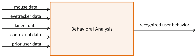
Fig. 3. Behavior analysis component overview.

knowledge repository as data storage. The knowledge repository works as an abstraction layer, decoupling the database from all other components. This enables the use of other languages than SQL to store data, since only the knowledge repository deals with the database itself. CogniWin also makes use of RabbitMQ 3.42, which is a message broker enabling communication between the different components. For example the eye tracker component will send its data asynchronously via RabbitMQ to the data fusion component, which will process it and send it to the knowledge repository for permanent storage which can be then requested by the well-being advisor.