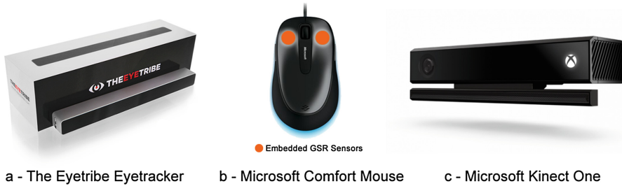
Fig. 2. CogniWin hardware components.