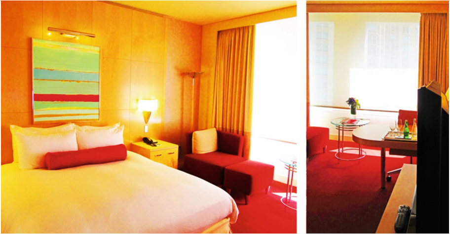
Fig. 5. Interior sound adjustment with a proper layout of materials in Sofitel Chicago Water Tower, Chicago IL. (USA).