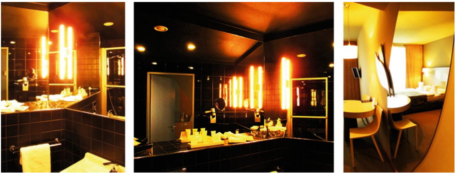
Fig. 4. Atmosphere of the Hotel Yasmin in Prague (The Czech Republic) is created with the use of color, textures of materials and mirror effects (Color figure online).

On the other hand, it is proved that innovative solutions may also draw clients. This was exemplified by findings from research conducted in the 5* Granada Hotel in Alanya in Turkey, particularly popular among guests from Germany and Russia [1]. The cited researched involved a questionnaire distributed among 200 guests and 97 hotel employees. Undoubtedly, the findings indicate a significant role of architectural innovations in fighting competition on the market [1].