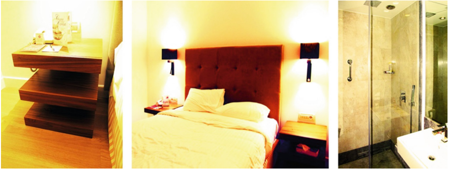
Fig. 3. Atmosphere of the Aquila Atlantis Hotel in Heraklion, Crete (Greece) is created by simple but high-quality materials (Color figure online).