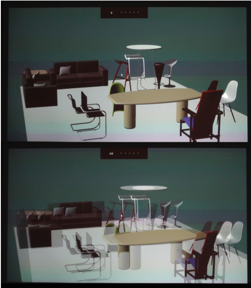
Fig. 2. Stereoscopic 3D displays and digital contents with different degrees of disparity