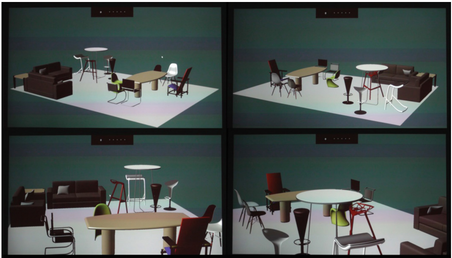
Fig. 4. Sample screen shots taken from different viewing angles and distances