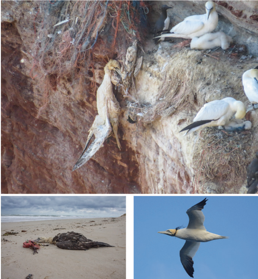
Fig. 4.1 Northern gannet entanglement. On a nest on Helgoland, Germany ( top ), on a beach on Texel, The Netherlands ( bottom left ) and with fishing nets wrapped around the neck ( bottom right )

Behavioural traits can be important factors in becoming entangled (Shaughnessy 1985; Woodley and Lavigne 1991). It has been suggested that sharks become entangled when investigating large floating items and when searching for food associated with clumps of lost fishing gear (Bird 1978). Prey fish, which use debris as a shelter, can increase entanglement risks for predators, such as sharks (Cliff et al. 2002) and fish (Tschernij and Larsson 2003). The ‘playful’ behaviour of marine mammals may increase the risk of entanglement (Mattlin and Cawthorn 1986; Laist 1987; Harcourt et al. 1994; Zavala-González and Mellink 1997; Hanni and Pyle 2000; Page et al. 2004). Zavala-González and Mellink (1997) and Hanni and Pyle (2000) explained a higher incidence of entanglement