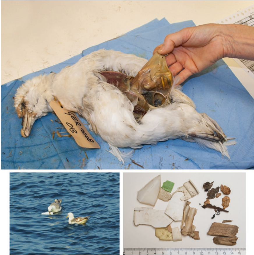
Fig. 4.4 Plastic ingestion by northern fulmars ( Fulmarus glacialis ). Unopened stomach with plastic inside ( top ), fulmars at sea chewing on a plastic fragment ( bottom left ), stomach content of a northern fulmar with fragments, foam, sheets and wood ( bottom right )