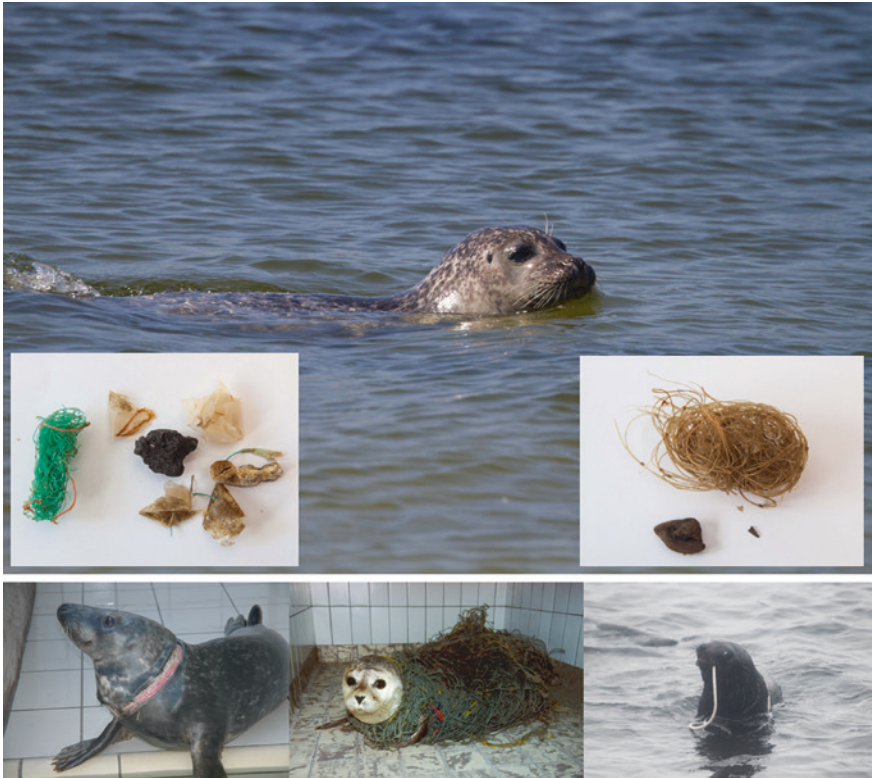
Fig. 4.2 Marine Mammal entanglement and plastic ingestion. Stomach contents of Dutch harbour seals ( top ), entangled grey seal ( bottom left ) and harbor seal (Texel, The Netherlands, bottom center ), Antarctic fur seal investigating a rope (Cape Shirreff, Antarctica, bottom right )

in younger California sea lions ( Zalophus californianus ) by playful behaviour and curiosity in combination with lack of experience and a foraging habit closer to the water surface. Age plays a significant role in pinnipeds, as younger seals are more often entangled than adults (Lucas 1992; Henderson 2001; Hofmeyr et al. 2006).