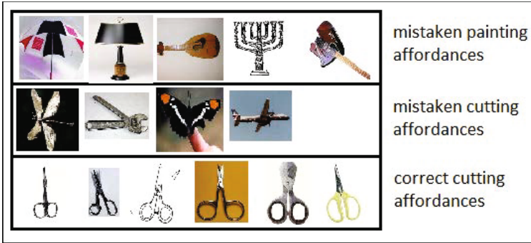
Fig. 4. Searching for affordances in the 101_ObjectCategories Caltech dataset