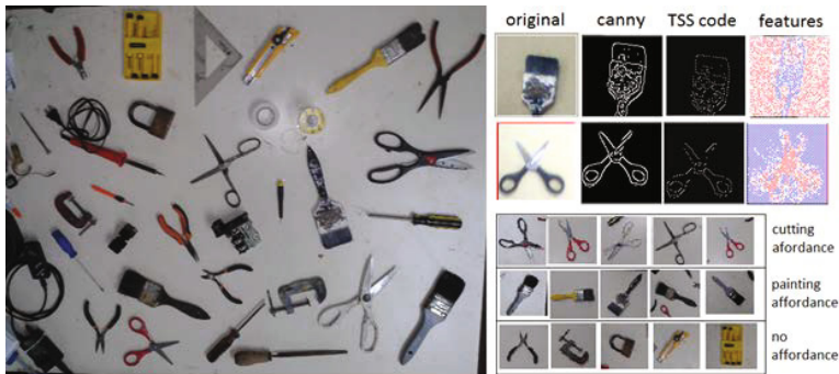
Fig. 3. Affordance perception for multiple object visualization