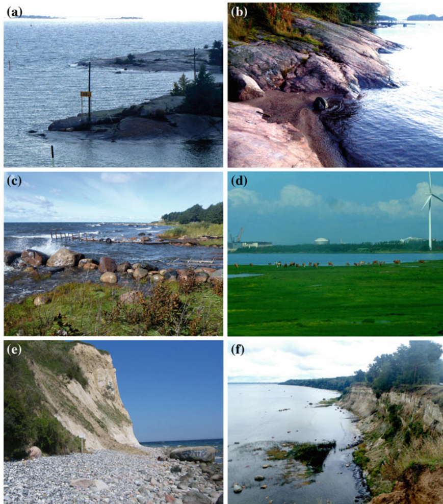
Fig. 20.2 Coastal types of the Baltic Sea. a Skerries in the Gulf of Finland, Finland; b Igneous rock, low coast shaped by glaciers, Helsinki, Finland; c Low coast of glacier boulders, northern Estonia; d Wetlands in southern Sweden near Malmö; e Rocky, chalk cliff covered by moraine sediments with an abrasive platform instead of beach, Rügen Island, Germany; f High-eroded cliff–klint coast in Estonia; g High soft moraine cliff coast of tills and fluvio-glacial sands, Wolin Island, Poland; h Typical cliff coast of tills and clays of moraine

deposits, landslides on the beach caused by ongoing storm surge, Sambian Peninsula, Kaliningrad region, Russia; i Low eroded coast without dune ridges in Heiligendamm, Germany; j Low coast of end moraine deposits covered by sands, Latvia; k Retreating dune coast entered and covered peatbog, Kolobrzeg, middle Polish coast; l Sandspit dunes: shifting inland with typical accumulative foredunes, Lebsko Lake Sandbar, Poland