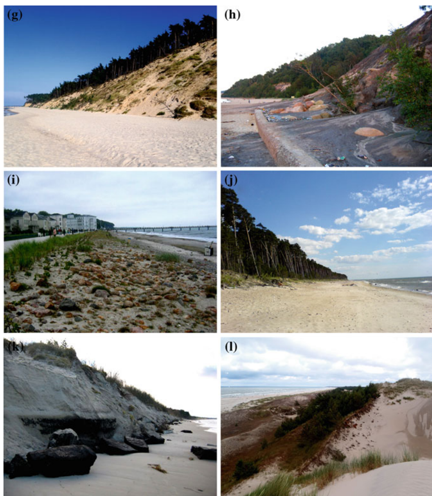
Fig. 20.2 (continued)

parallel to the coastline. The ridges are generally no higher than 8 m, but where uplift is slower, a few reach 20 m. The south-western coast of Finland near the Åland Islands has many skerries, forming a huge archipelago. In total, there are some 73,000 islands along the coast of Finland.