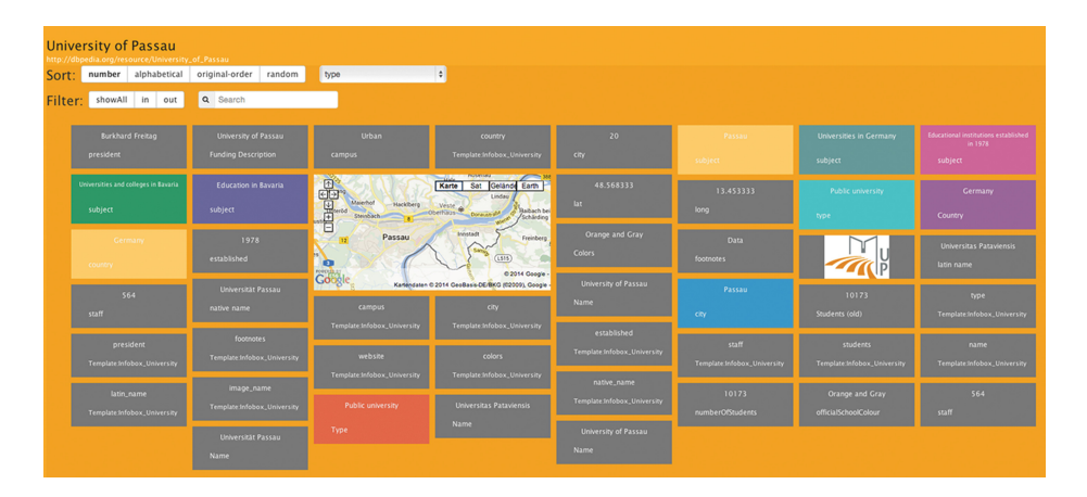
Fig. 1. Viewing an example entity with enriched information and ontology templating

The user interface of balloon Synopsis is inspired by modern operation systems and design trends. A main principle is to focus on the content and direct relationship between semantic entities rather than showing a global and complex context. Semantic entities (graph nodes) are considered as autonomous tiles, containing information about the entity itself. Clicking on a tile gives the user the possibility to view the represented resource in detail, leading to a new node-centric overlay. Figure 1 shows a screenshot of a detail view. All related information or entities are again arranged as clickable tiles, allowing an iteratively browsing trough the data.