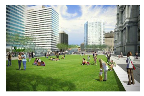
Fig. 9. The image of City's Living Room

The raid tempo of contemporary city life makes it crucial to provide a space for people to calm down from tense city lives for contemplation. With the idea of regarding a city as a house, providing a living room for a city would be very crucial for people to interact and communicate within this public open space with the practical functions of transportation, shopping, and with cultural functions. Based on the concept of Oriental Cloud Platform, the concept of City's Living Room is a practical architectural approach to create a mega public space that allows citizens and international tourists to interact, communicate, and to be fulfilled with commercial functions by shopping spaces and facilities and with cultural facilities such as museums, theaters and other leisure facilities (Fig. 9, Fig. 10).