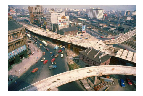
Fig. 5. The North Gate