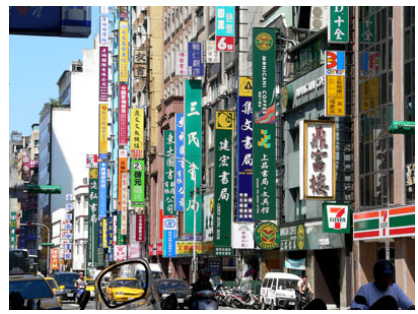
Fig. 7. Chongcing Bookstore Street