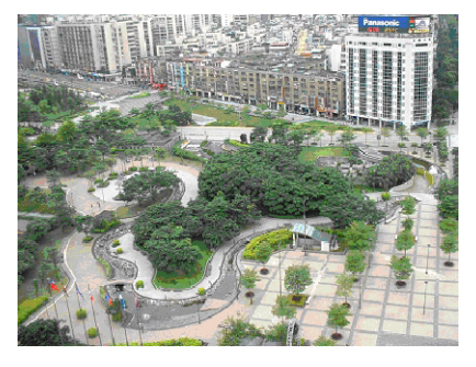
Fig. 10. The open space of the C1D1