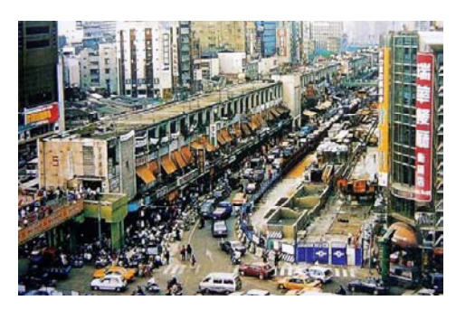
Fig. 6. Ximending in the 1950s