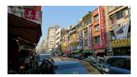
Fig. 8. Wholesale Industrial Zone