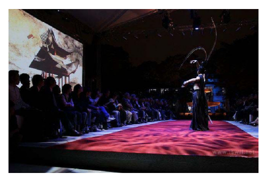
Fig. 13. The Fashion and Digital Exhibition Hall