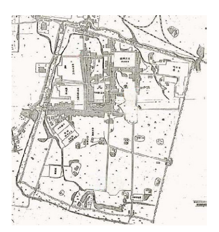
Fig. 2. Taipei City in the Qing Dynasty

Taipei City as one of the oldest cities in Taiwan has experienced and witnessed flourishing and prosperous development. Since three centuries ago, Taipei City has developed from a rural to an international metropolis. Taipei City started to develop when the Qing Empire occupied Taiwan in 1709. In the end of the 19<sup>th</sup> century, following traditional Chinese urban format, Taipei City developed with a north-south axis in the square shape. Taipei City encompassed four key categories of urban development including temples for god worship, schools and colleges for education, administrative offices for political control, and street and industrial areas extended from five gates of the city (Fig. 2). From 1895 until 1945, Taiwan was occupied by Japan. Taipei City thus experienced another stage of modern development under the attempt of Japanese colonization (Fig. 3).