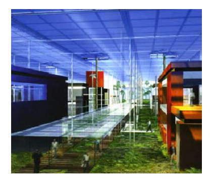
Fig. 12. The Cultural Corridor