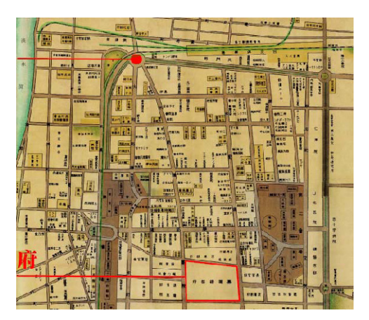
Fig. 3. Taipei City during 1895 and 1945