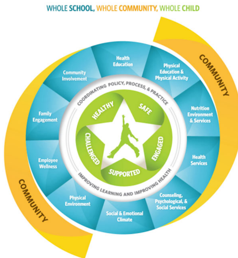
Fig. 22.3 The ‘Whole School Whole Community Whole Child’ model, developed by CDC and ASCD