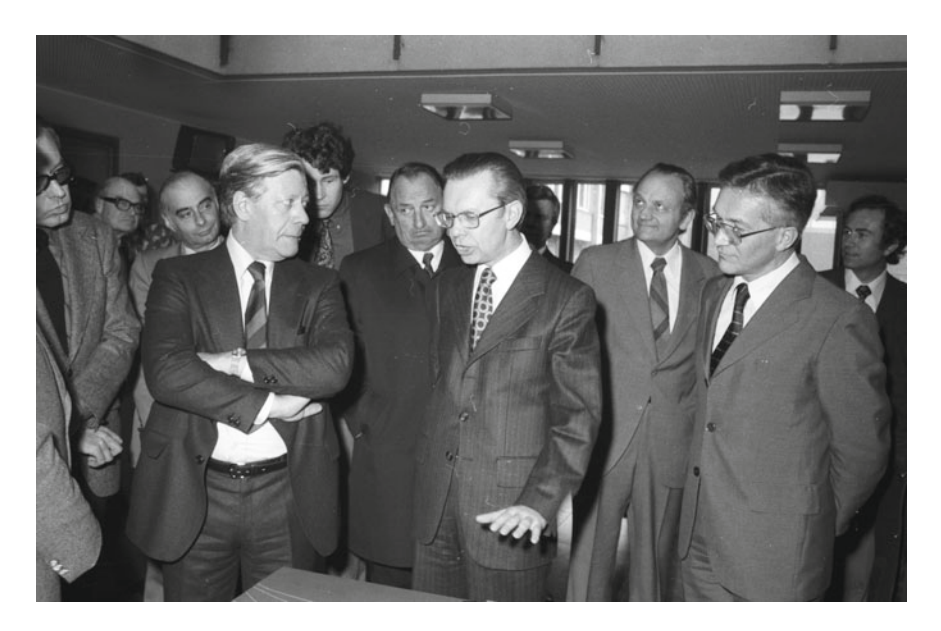
Fig. 6.4 Chancellor Helmut Schmidt visited DESY on 11 March 1977 to take stock of progress on the PETRA storage ring

"With him we discussed what the next machine at DESY could be," recalled Herwig, "and after some discussions, and taking into account the possible cost and the available size of the site, we came up with a proposal to build an electron–positron machine with a maximum energy of about 20 GeV." If successful, it would be the largest facility of its kind on the world. They named the project the Positron–Elektron Tandem Ring Anlage (positron–electron tandem ring facility), PETRA. "I decided to continue the tradition of giving DESY's machines female names," recalled Herwig, "a sign of the times, I suppose, since PETRA's positron injector, the Positron Injector Accelerator (PIA), followed suit. It was not easy to get PETRA approved, but I was optimistic after the success of DORIS."