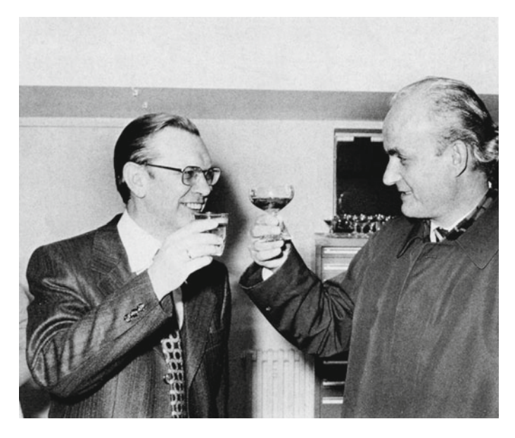
Fig. 6.5 Herwig raises a toast on 27 January 1976 with German research and technology minister Hans Matthöfer on the occasion of the laying of the foundation stone for PETRA