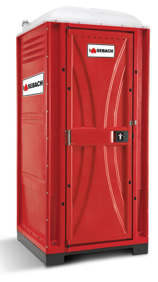
Fig. 1. The Top San No Touch 2.0 portable toilet, Sebach S.p.a.

of the product integrated with the regulatory requirements and characteristics of the company's production reality.