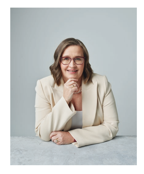
Fig. 6.1 Sex Discrimination Commissioner Kate Jenkins undertook a landmark review of Australian parliamentary workplaces.

The Australian data collection was larger than for any comparable inquiry. As noted in Chap. 3, special legislation was passed in March making submissions to the inquiry exempt from Freedom of Information (FOI) requests, allaying fears of staffers over the confidentiality of their