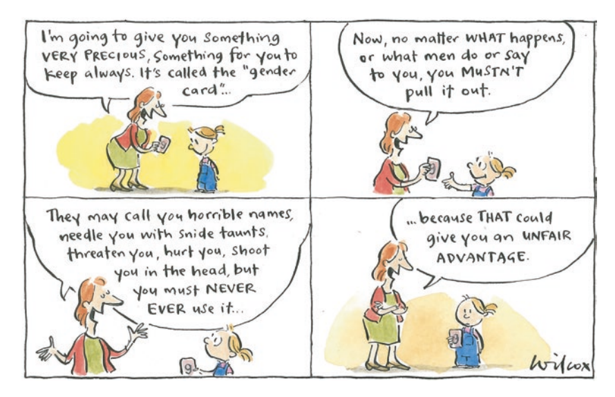
Fig. 3.1 Wilcox, The Gender Card, Sun-Herald, 14 October 2012. (Courtesy Cathy Wilcox)

references to her genitals and menstruation. Nonetheless, some Opposition women suggested that by drawing attention to such sexist vilification the Prime Minister was presenting herself as a victim and therefore was automatically a loser in the political contest.<sup>24</sup>