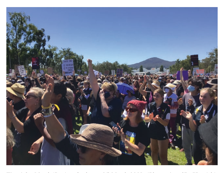
Fig. 4.2 March4Justice, Canberra, 15 March 2021.

Morrison's subsequent statement that the demonstration was a triumph of democracy because 'not far from here such marches, even now, are being met with bullets' reverberated around the country. Revelations continued relentlessly. Only a week after the March4Justice events, government staffers were found to be sharing a video of a male staffer masturbating on a female MP's desk. The incident illustrated the social science finding that women in positions of power are not immune from forms of sexual harassment and that subordinates or colleagues may resort to harassment as a 'power equaliser'. <sup>19</sup>