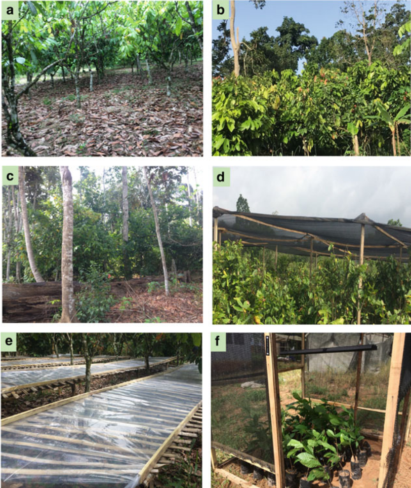
Fig. 2.1 Different cocoa farm configurations and stress trials. A Cocoa farm without shade trees. B Cocoa agroforestry with remaining shade trees from clearing of the land. C Cocoa agroforestry with planted shade trees ( Terminalia sp. and Triplochiton scleroxylon ). D and E Experiment with a mature cocoa stand under 40% shade using an artificial shade net and with rainwater exclusion. F Experiment with cocoa seedlings exposed to heat from non-glowing heaters, with shade