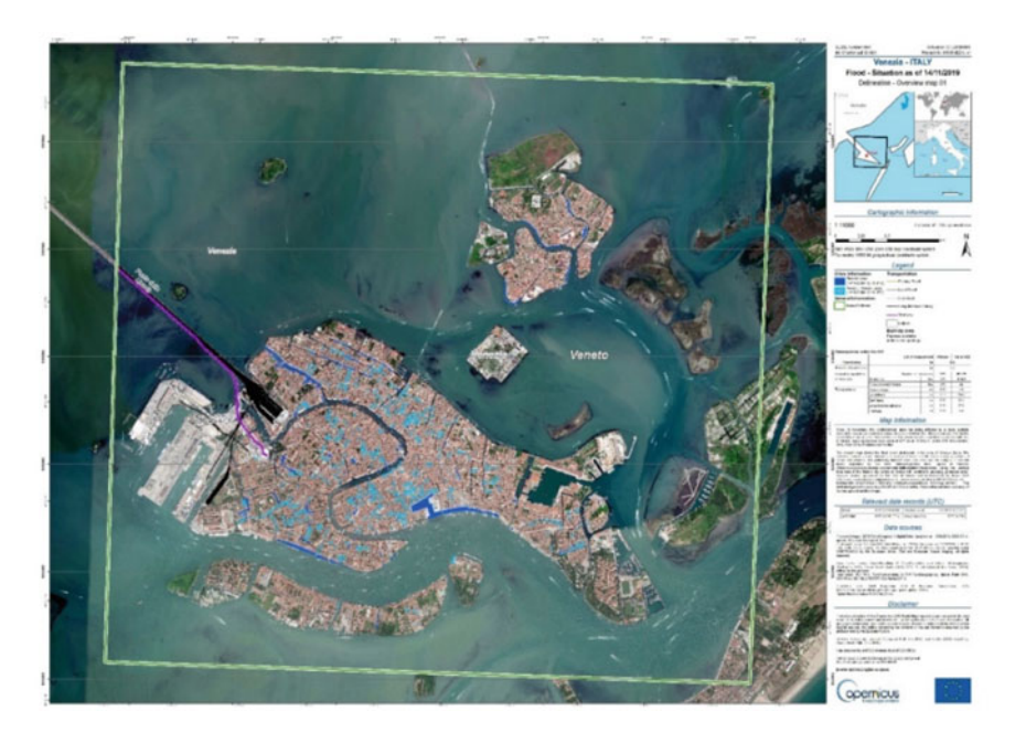
Fig. 53.5 High-resolution image of the flooding that occurred in Venice on 19th November 2019. The different levels of high tide flooding were scanned in real time by altimetry sensors. The restitution of the image represents the flooding with different

(DT) for built environment. Urban DT is designed as three-dimensional databases that are continuously fed with real time data representing both the building components as well as their qualities and other useful information, with the aim of giving a complete picture of the state-of-the-art and in the meantime simulating activities and management of processes of operation (Weekes 2019). The concept of DT implemented at the scale of urban environments is leading to the concept of City Digital Twin (CDT), a virtual model that takes the analysis from the single building (or even single housing unit) to a higher and more complex level, requiring the highest level of interdisciplinary integration to be jointly defined in the near future.