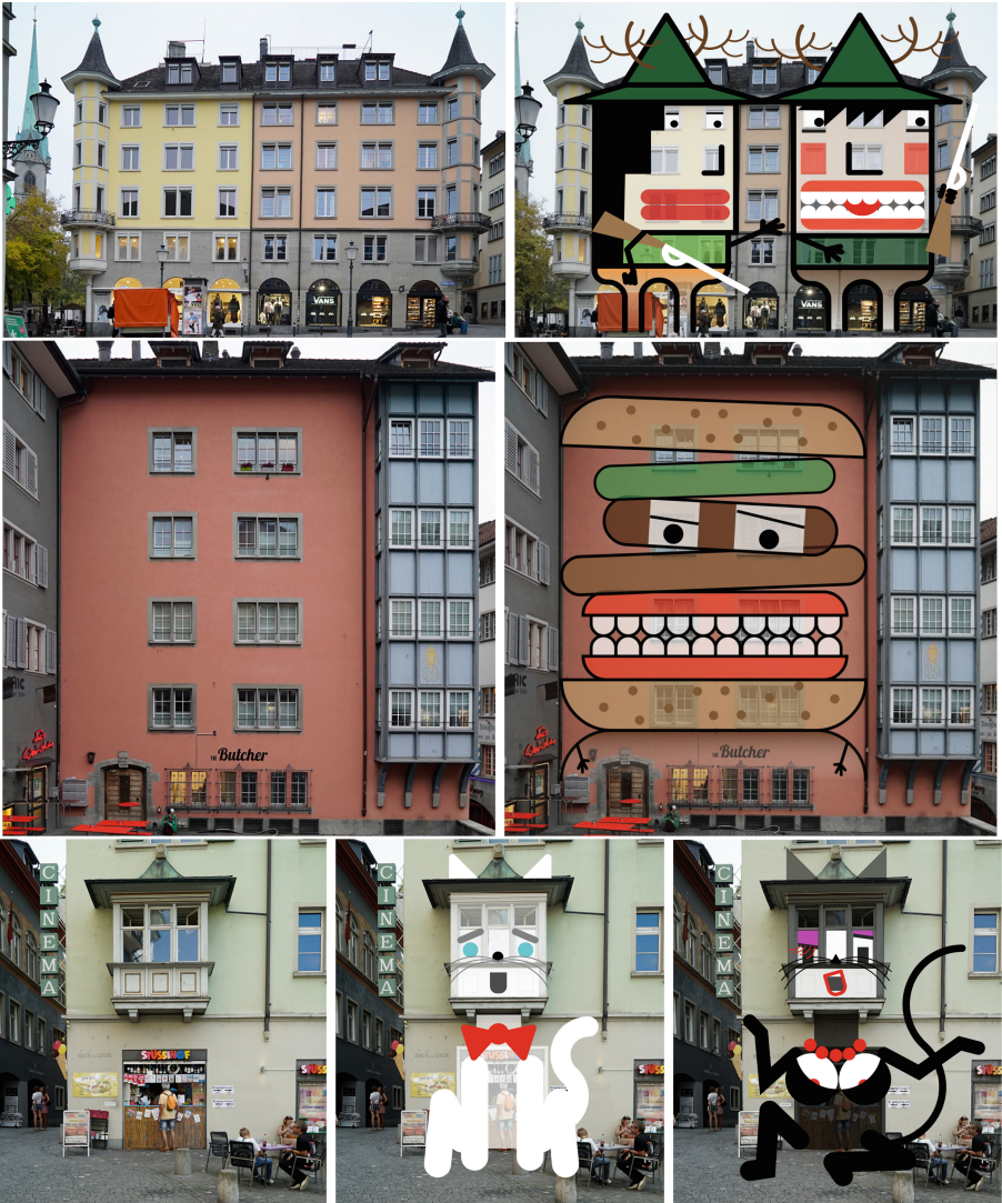
Fig. 1. On the left we present some of the selected buildings with their corresponding augmented characters to the right.