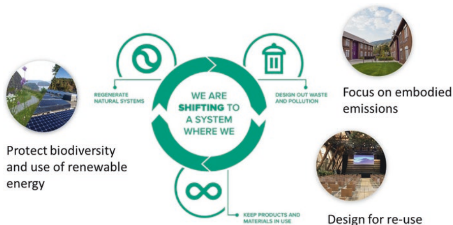
Fig. 16.1 Focus areas to reduce environmental impacts in the construction sector. (Sparrevik et al. (2021))

building solution, thus capturing that ‘contribution’ across different impact categories simultaneously. In addition, life cycle-based management schemes, and regulations support environmental performance across the building life cycle better, consequently affecting the variety of actors in the construction industry. The individual effects of these methods, schemes and regulations are widely investigated in literature (Gallego-Schmid et al. 2020; Górecki et al. 2019; Munaro et al. 2020). However, it is also important to consider the role and impact of these methods in different systemic dimensions, a topic often overlooked. Applying the CapSEM Model to the construction industry and built environment gives a better understanding of impacts horizontally (across topics and involved sectors), and vertically (from individual projects to international bodies).