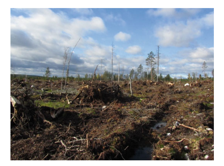
Fig. 18.1 Forest stand subjected to clear-felling and stump harvest.

Jonsson et al., 2005; Kouki & Salo, 2020; Kuuluvainen, 2009; Paillet et al., 2010; Siitonen, 2001; Stenbacka et al., 2010). Forests are the most important habitat for red-listed and threatened species in Sweden and Finland. In Finland, 32% (2,133 species) of red-listed species are forest dwelling (Hyvärinen et al., 2019). Similarly, 43% (2,041 species) of the red-listed species in Sweden are forest dwelling (Artdatabanken, 2020). The species most negatively affected by silviculture are old-growth specialists dependent on a long forest continuity and old trees and species associated with deciduous trees (Artdatabanken, 2020; Bernes, 2011; Hyvärinen et al., 2019). Efforts to mitigate these adverse effects on biodiversity have been introduced to limit the harmful effects of the prevailing forestry practices on species and habitats.