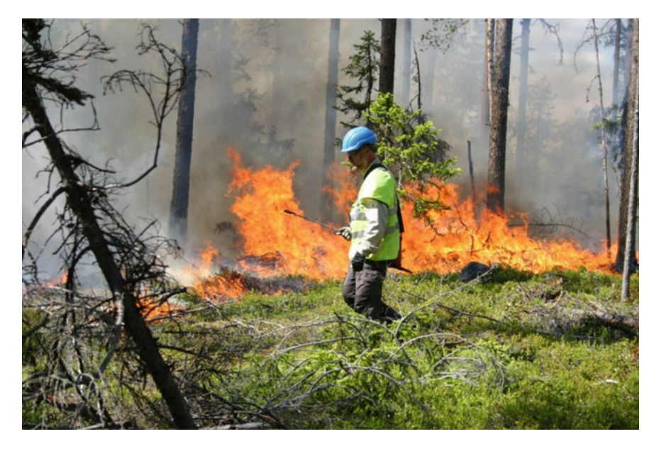
Fig. 18.2 Prescribed burn of a forest stand as part of an ecological restoration experiment in Sweden (see e.g., Hägglund et al., 2020; Hjältén et al., 2017; Versluijs et al., 2017)

Prescribed burning of clear-cut areas is a traditional management method in forestry in Fennoscandia (Fig. 18.2). Its primary purpose is to modify soil properties and promote the establishment of a new tree cohort; however, the method was abandoned because of pest- and pathogen-related damage and high labor costs. Therefore, this technique was replaced by mechanical site preparation methods (Löf et al., 2015). Methods of prescribed burning for ecological restoration vary and involve different levels of tree retention. A few recent experiments have explored the effects of prescribed burning on biodiversity patterns. Most of these studies have included various types or intensities of tree harvests combined with prescribed burns; however, some studies also included comparisons with other restoration methods. The consequences of prescribed burns have been monitored, at least, for birds, beetles and other invertebrates, wood-associated and other macrofungi, vascular plants, bryophytes and lichens, and tree seedlings. The treated forest stands typically cover 2 to 25 ha and can be regarded as large-scale experiments in a Fennoscandian context.