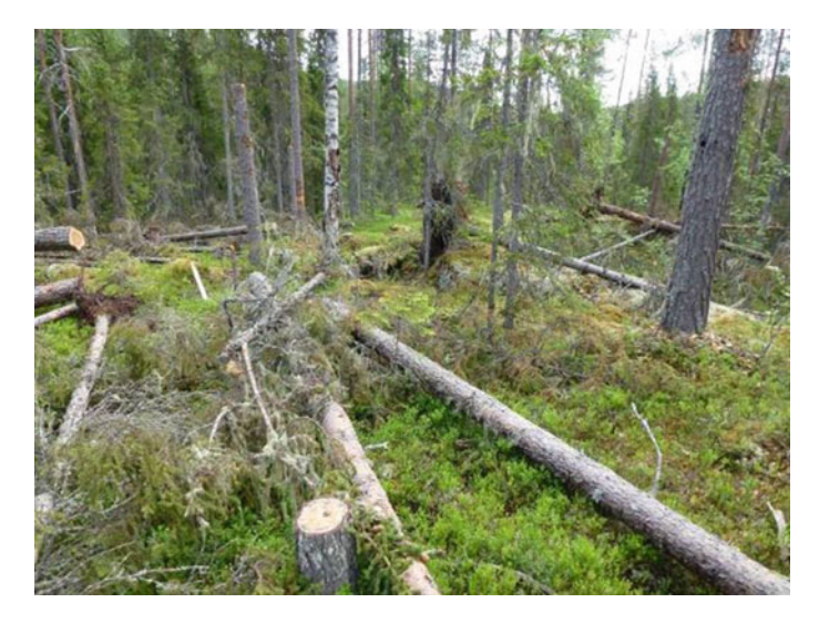
Fig. 18.4 Gap cutting includes creating deadwood as part of an ecological restoration experiment in Sweden (see e.g., Hägglund et al., 2020; Hjältén et al., 2017; Versluijs et al., 2017)

combined effect of too-small gaps to attract open-area or edge specialists and a lack of response in the understory vegetation. Forsman et al. (2013), studying larger gaps, also did not find any general effect of gap disturbance on the overall abundance and richness of boreal-forest bird species. This could suggest that organisms such as birds that have larger home ranges, a larger spatial scale must be considered for restoration efforts and subsequent assessment (Hof & Hjältén, 2018).