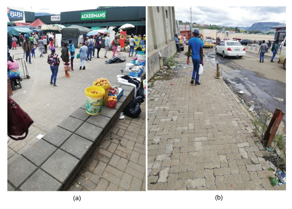
Fig. 3.3 Pressure on the Phuthaditjhaba CBD.