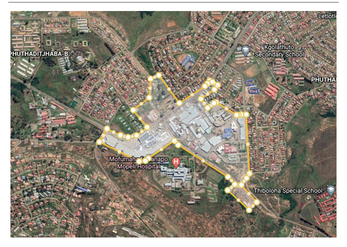
Fig. 3.2 Setsing Locality outlined in yellow.

between the environmental or ecological perspective and a more market-driven view. Jabareen (2008:181) termed this tension an ethical paradox between a sustainable state that can be maintained perpetually and development that implies environmental intervention.