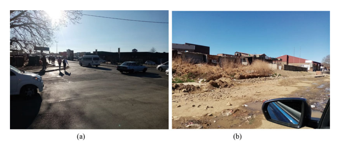
Fig. 3.4 Road infrastructure challenges.

traffic transgressions caused by a lack of demarcation of road markings and non-functioning traffic lights. Figure 3.4b shows poor governance, displayed by uncleanliness in the town and an incomplete road surface.