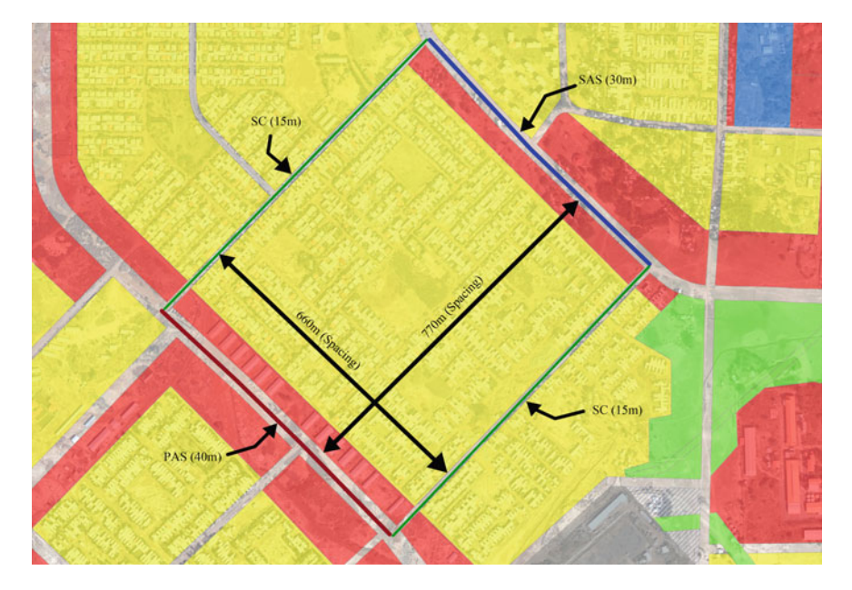
Fig. 9.2 A zoomed-in image of a super block of the 2020–2030 Structural Plan of Bahir Dar City: proposed major land use (major road network)

The 2020–2030 Bahir Dar City SP proposed a superblock with major land use and street network (Fig. 9.2). The superblock is defined by major streets: two 15 m wide Collector Streets (CSs), a 30 m wide Sub Arterial Street (SAS), and a 40 m wide Principal Street which is subdivided by many small blocks with 10 m wide Local Streets (LS). But its size is about 660 m \times 770 m exceeding the street spacing standard meaning that at least two CSs that connect the two opposite sides should be introduced into the superblock as per the spacing standard demand. However, the participating stakeholders of the project could not accept this standard and challenged the application of the standard in the structural plan of Bahir Dar with the following arguments. According to them, meeting the national planning standard or reserving appropriate width (right of way) for streets in the SP would