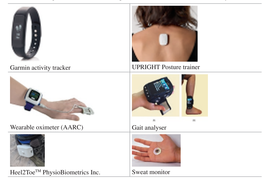
Table 5.3 Examples of wearable technologies that can monitor the QoL of the body

These mobility measures relate to activity but it is also possible to track motor impairments that lead to mobility limitations such as slowness of movements that can result from stiff joints, resting and intention tremors, poor posture, balance, and poor gait quality. Monitoring these impairments would require different technologies distributed to different parts of the body, but all are possible. There are apps for tremor and balance that require the person hold a smart phone. Posture, balance and gait quality can be measured using inertial devices attached to the back [64] or to the shoe [65–68]. A selection of wearable devices for mobility and health are shown below (Table 5.3).