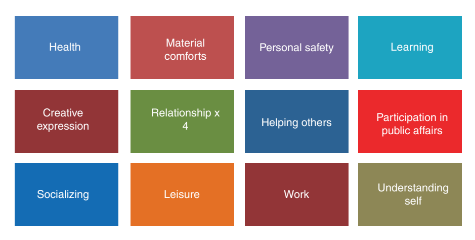
Fig. 5.2 Flanagan's (1978) Components of QOL

Based on the literature [36, 53, 54] and the clinical and research experience of the authors, an estimated 1/3 of QoL of the person would be explained by mobility, with helping others and active recreation most affected and learning, understanding self, and creativity the least affected (see Fig. 5.3).