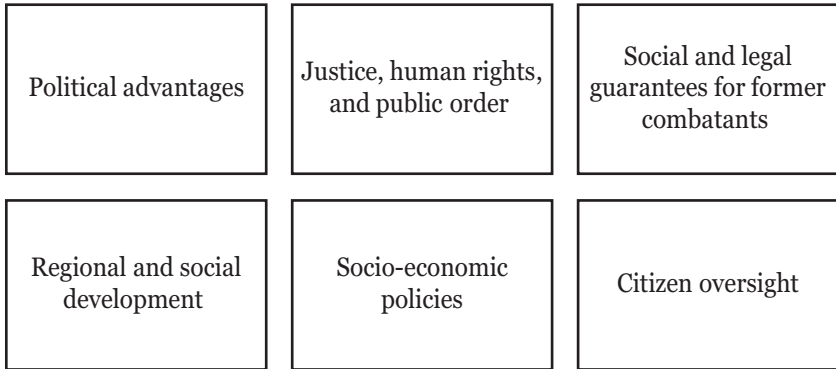
Fig. 3.1 Main drivers of mediation processes with irregular groups in Colombia

failure to achieve DDR, Colombia was able to foster a remarkable group of mediators, who played key roles in negotiations with the AUC and the FARC-EP in 2016 (Villaveces 2003).