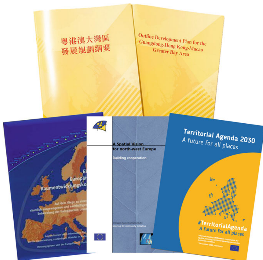
Fig. 4.1 Strategic planning documents in Europe and the Pearl River Delta. Clockwise from top left, outline development plan for the Guangdong-Hong Kong-Macao Greater Bay Area (Chinese version and courtesy translation into English; Greater Bay Area development office, 2019); Territorial agenda 2030 (European Commission 2021a, b); A Spatial Vision for North-west Europe (NWMA 2000); and the European Spatial Development Perspective (CSD 1999) (German edition)

despite various coordinating mechanisms, often pays scant attention to other sectors. Sub-national and local governments also make policy within their jurisdictional compartments—the geographical scope of their power. Their policies will often reflect competition with their neighbouring authorities rather than complementarity. This is a long-standing barrier to effective governance of the territory (European Commission 1998). Policy making in discrete sectors has advantages, it is certainly less costly than seeking coordination, and integration with other sector policies may dilute central objectives (Peters 2018; Candel 2021). It is inevitable that the complex