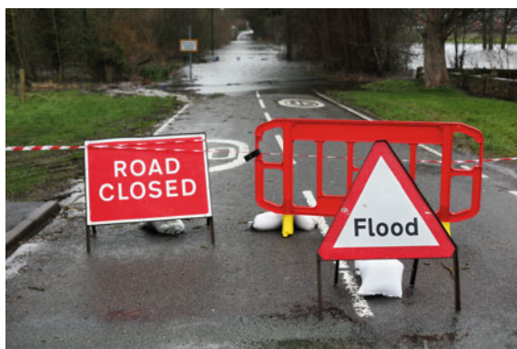
Fig. 4.3 Flood warnings in England

recession. There has also been resistance where there is a strong urbanist or architectural tradition in planning, and where more neo-liberal attitudes prevail. Nevertheless, there is evidence that the notion of 'the spatial planning approach' has been influential. By the late 2010s, cross-fertilisation was more intensive, not just information sharing among sectors, but involving active cooperation and sometimes coordination of policy (Nadin et al. 2018). Improvements have been gained by bolting on ad hoc tools to the planning process, such as impact assessments of policy, requirements for conformity among plans, joint working on data and analysis and ad hoc cooperation platforms. In some countries, the scope of plans and strategies has been widened.