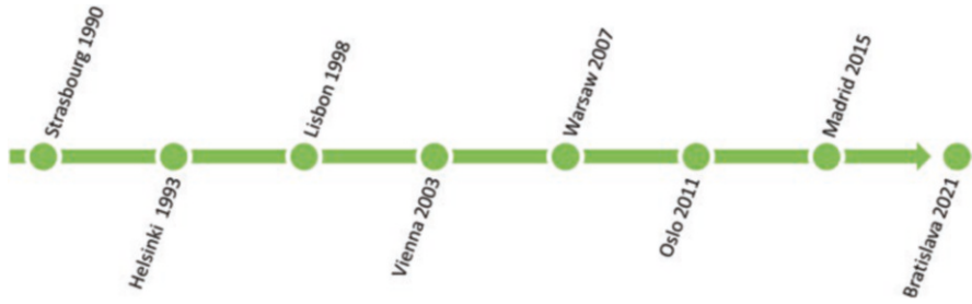
Fig. 2.3 Forest Europe Ministerial Conference on the Protection of forests in Europe (Former MCPFE) timeframe. The eighth Ministerial Conference will take place in April 2021 in Bratislava (Slovakia)

forest management concerns. The Pan-European C&I for SFM are collected in a harmonized way, are broadly accepted by policy makers, cover the most important forest ecosystem services, and are publicly available. This makes them a suitable basis for further development toward an indicator set for the assessment of CSF at a European scale.