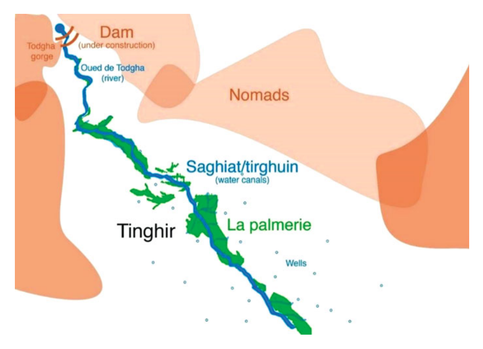
Fig. 4.1 Tinghir and the surrounding oasis

years, the valley has progressively become marginalized due to a strong rural exodus and brain drain towards big cities and foreign - mainly European - countries. Whilst, especially between the 1960s and 1970s, labour migration schemes were put in place to send the region's inhabitants to European countries such as Belgium and France, emigration is still ongoing. Male migrant workers were recruited from all social backgrounds, though more often from extremely poor families. Remittances from migrant workers living in Europe were mainly used to invest in Morocco's 'new' economy, in which remittances are invested in small businesses such as the construction trades, local transportation services, or civil service positions that resulted from increased investments in vocational training, secondary education, and business ownership. Moreover, this accelerated households' move away from the 'old' economy, which was based on land and livestock ownership (Kusunose and Rignall 2018). At the same time, the municipality of Tinghir itself attracts also a lot of immigrants from the wider surroundings (De Haas and El Ghanjou 2000), and nowadays even hosts many retired return migrants that decide to spend time in both their region of origin and Europe as a compromise between their two 'home' countries (De Haas 2006; Kusunose and Rignall 2018).