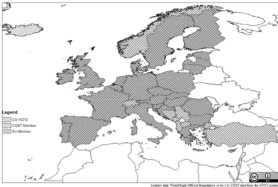
Fig. 1.1 European Union member countries during the key phase of COST Action CA15212 (the UK left the EU on 1 February 2020) and member countries of COST. Except for Moldova and Iceland, all COST countries are members of CA15212. Country data: World Bank Official Boundaries; COST data from www.cost.eu

The main tool in COST are Actions, which are networks that are supported by funding for travel costs for workshops and training schools, and also scientific exchanges which are called Short Term Scientific Missions (STSM). The member countries nominate the members of each Management Committee (MC) – the key decision-making body of each Action. The vision of COST is to support innovative,