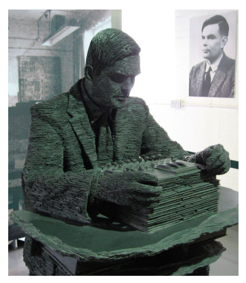
Fig. 2.2 Alan Turing (1912–1954)

In 1950 Alan Turing (see Fig. 2.2) suggested that it might be possible to determine if a machine is intelligent based on its ability to exhibit intelligent behaviour which is indistinguishable from an intelligent human's behaviour. Turing described a conversational agent that would be interviewed by a human. If the human was unable to determine whether or not the machine was a person then the machine would be viewed as having passed the test. Turing's argument has been both highly influential and also very controversial. For example, Turing does not specify how long the