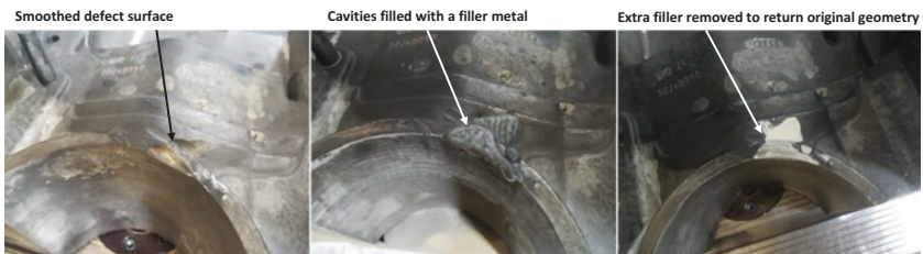
Fig. 1 The three main phases of refurbishing metal dies.

The hybrid workstation used in refurbishing dies is a DMG Mori Lasertec 65—the workstation integrates laser-deposition melting technology with a 5-axis milling station. The station is able to automatically change between the laser- and the milling-heads. Limitations that the workstation has have to do with the volume and the weight of the worked-on parts ( \text{Ø } 500 \text{ mm} \times 400 \text{ mm} ; 600 kg)—this kind of limitations are “real” in terms of the workstation not being able to handle larger and heavier objects; as technology is developed further these limitations are slowly relaxed, but the limitations mentioned are on a “good modern