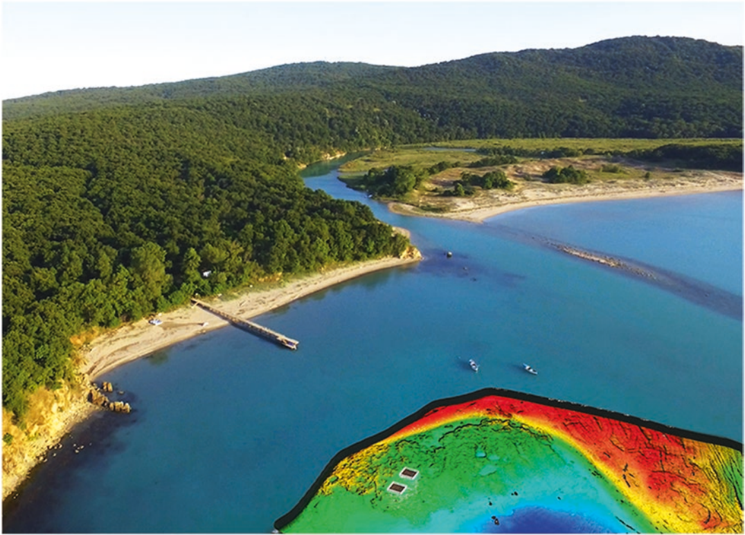
Fig. 20.9 Ropotamo Bay. Aerial view of the site overlaid with bathymetry in order to show location of the underwater excavation trenches.