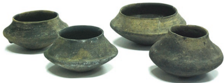
Fig. 20.6 Pottery from Arsenala.

The faunal remains comprise over 7000 specimens and are dominated by wild animals, especially aurochs ( Bos primigenius ), red deer ( Cervus elaphus ), roe deer ( Capreolus capreolus ) boar ( Sus scrofa ) and various bird species. There are also numerous bones of tuna and dolphin, suggesting the use of boats for offshore and deep-water marine exploitation. Domestic animals are cattle and horse, the latter including 40 skulls, 20 of which are intact and arranged in such a way as to suggest some cultic significance along with 5 pairs of aurochs horns apparently arranged in a deliberate pattern. Pollen data show evidence of forest clearance but no indications of cereal agriculture.