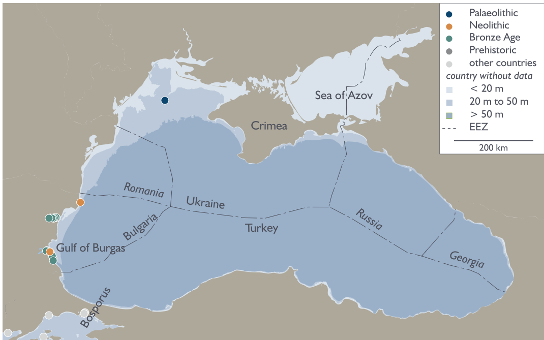
Fig. 20.1 General map of the Black Sea showing distribution of underwater sites, simplified bathymetry and the boundaries of the exclusive economic zones of each state (the boundary between Russia and the Ukraine is in dispute at the time of writing following the annexation of Crimea in 2014). The Palaeolithic site in Ukraine refers to artefacts recovered from a marine core (see Kadurin et al., Chap. 21, this volume). Site information from the SPLASHCOS Viewer http://splashcos-viewer.eu . Drawing by Moritz Mennenga

The Black Sea is a constituent part of the Greater Mediterranean Sea, connected to the Sea of Marmara in the south via the Bosphorus channel, and to the Sea of Azov by the Kerch Strait in the north. However, periodically in the Late Quaternary during periods of low global sea level, the Black Sea was isolated and formed a freshwater or brackish lake (Badertscher et al. 2011). The most recent episode of isolation was during the Last Glacial period, and the question as to when this isolation occurred, how long it persisted, the lake levels during this period and the nature of the reconnection of the lake with the global marine system through the Bosphorus, informs an intense debate about Black Sea inundation and its human impact (for details of this debate see Ryan et al. 1997, 2003; Aksu et al.