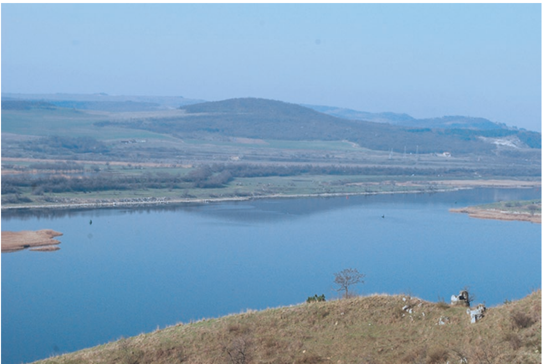
Fig. 20.4 View of Lake Varna, looking south.