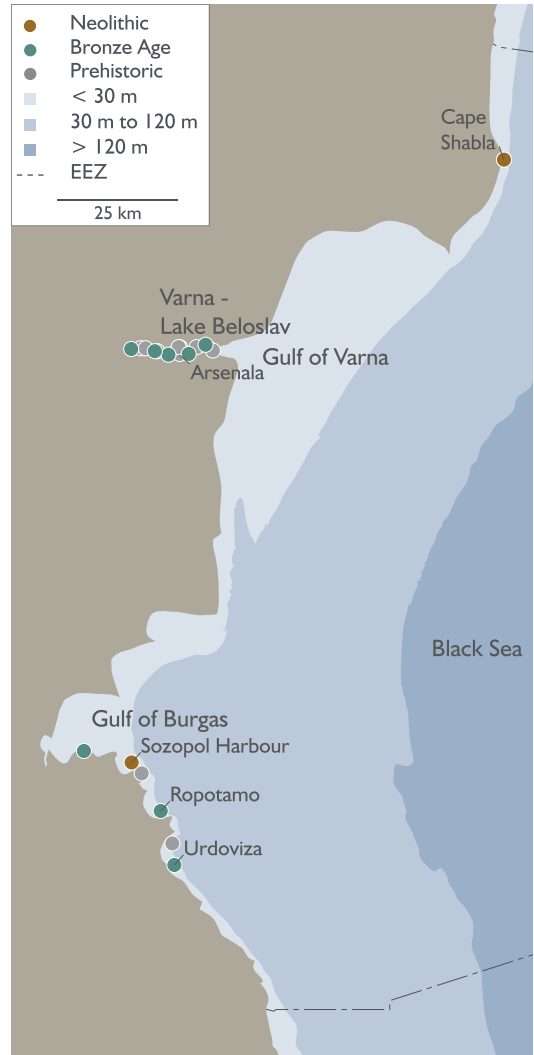
Fig. 20.2 Detailed map of submerged sites on the Bulgarian coast. Site information from the SPLASHCOS Viewer http://splashcos-viewer.eu . Drawing by Moritz Mennenga

Of these sites, Shabla is on the northern coast of Bulgaria, 13 are located in the Varna-Beloslav Lake area (Ivanov 1993) and five along the southern Bulgarian shore (Draganov 1995; Filipova-