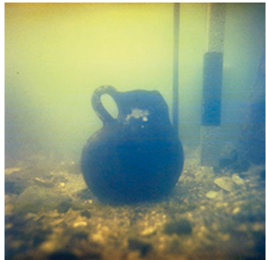
Fig. 20.5 Early Bronze Age pottery shown in situ at the submerged site of Arsenala. Scale in 10 cm intervals.

The pollen analytical work of Filipova-Marinova et al. (2016) in Lake Varna shows two episodes of deforestation and cereal cultivation with an interval in between of re-afforestation and reduction in indicators of human influence. The first episode of deforestation is dated to 6140–5820 cal BP (4190–3870 cal BC), corresponding to the Late Eneolithic occupation at Arsenala. The second episode begins at 5500 cal BP (3550 cal BC) and corresponds to the middle