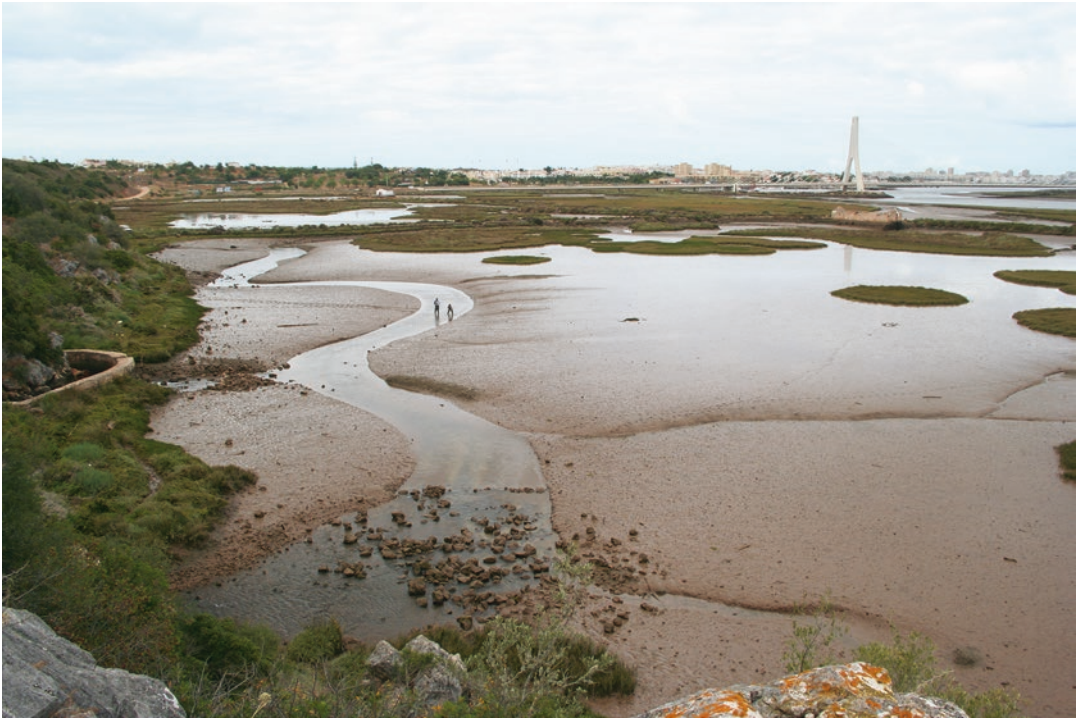
Fig. 14.4 View from Ibn Ammar entrance towards the estuary during low tide, when shellfish resources are available as well as fresh water coming out from the various cave springs (seen on the left side of the photo, where the wall is located).