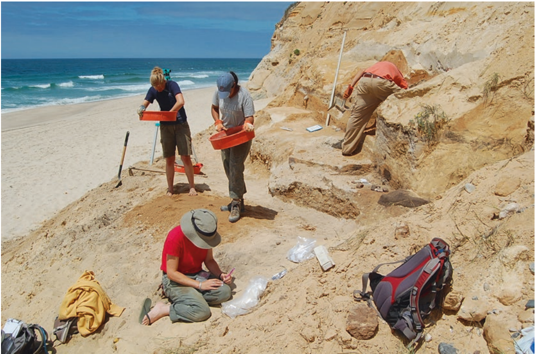
Fig. 14.3 Excavation at Praia Rei Cortiço during low tide. The archaeologists are standing just below the horizon that represents Neanderthal coastal occupation during the MIS 5 c. 115,000 years ago. Most of the site was washed away during a high tide in 2014.