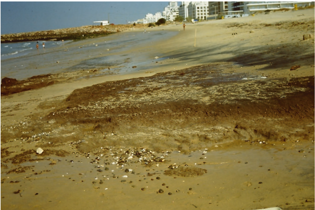
Fig. 14.5 The dark organic layer seen in the centre of the photo is rich in remains of coastal habitation. This c. 7000-year-old site, located in the intertidal zone, is shown here on a rare occasion of surface sand erosion due to wave and current action. Praia do Forte Novo.