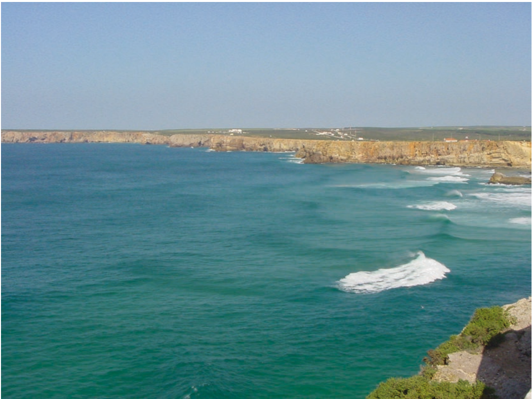
Fig. 14.7 General view of the southwestern coast of Sagres, with limestone cliffs 70–100-m high where caves are very common.

Many other areas need to be scrutinized, topographically reconstructed, tested and, in specific cases, excavated. A multidisciplinary research program at the University of Algarve is now under development to study the prehistoric human occupation of coastal cave settings in southern Portugal.