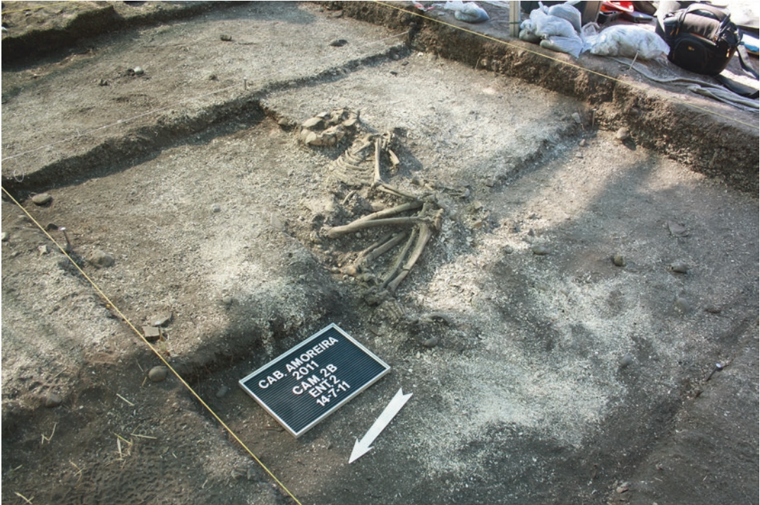
Fig. 14.2 Mesolithic human burial in Cabeço da Amoreira, Muge. The isotopic information indicates that this skeleton belongs to a person whose diet was composed of c. 50% marine resources.