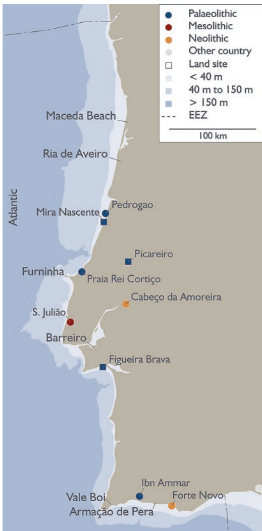
Fig. 14.1 Map of Portugal showing distribution of sites. Site information from the SPLASHCOS Viewer http://splashcos-viewer.eu . Drawing by Moritz Mennenga

At present, we have identified only six prehistoric underwater sites—these include fully submerged as well as intertidal locations; three are dated to the Middle Palaeolithic, one to the Mesolithic and two to Neolithic occurrences. These sites were originally open-air locations, and those found in the intertidal zone are especially liable to destruction by wave action. Four have been partially excavated, and three are still part of ongoing projects in central and southern Portugal.