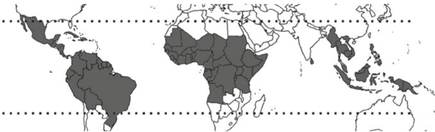
Fig. 5 Tropical strip in which the architects were chosen for future city projects

We thought that to know and inhabit the tropical belt, live out and interpret a unified geographical area, in many respects common to South America, Africa and Asia, might be a necessary premise to get consistent responses for the interpretation of a territory, of a landscape, of an environment as hostile as captivating. A choice detached from any economic or neo-colonialist logic, a selection respectful of concordant geographical units that in a certain sense unify a community of architects influenced by a habitual style of living; a geographical identity, the tropical one, still