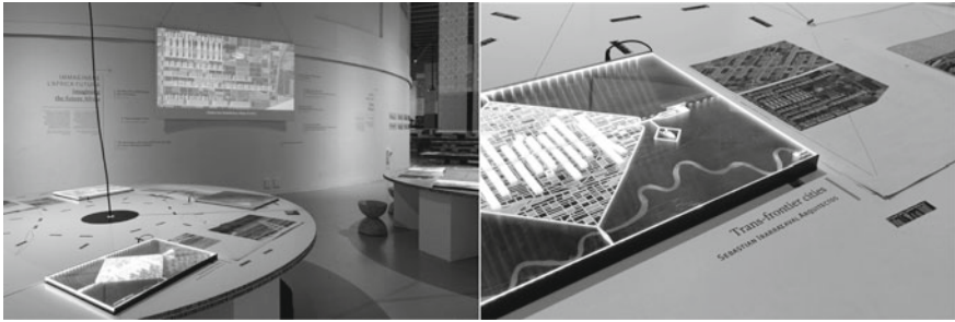
Fig. 7 Triennale di Milano, The exhibition “Africa Big Change Big Chance” with models and research notebooks “imagine the future of Africa” (Albrecht 2014)

Boubacar Seck are but the first 7 architectural firms that along with us have concretely imagined new ideas for living Africa’s future.