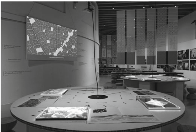
Fig. 6 Triennale di Milano, The exhibition “Africa Big Change Big Chance”