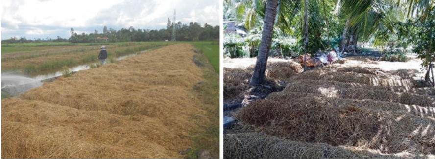
Fig. 6.3 Growing RSM outdoors