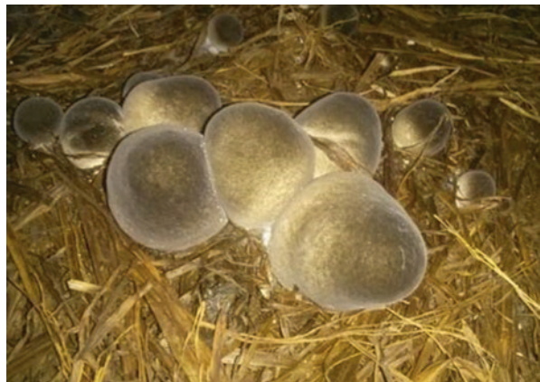
Fig. 6.1 Volvariella volvacea (Bull.; Fr.) Singer is an edible mushroom also known as the straw mushroom and, for our purposes, the rice-straw mushroom (RSM)

RSM is known as a healthy food (Belewu and Belewu 2005; Feeney et al. 2014b; USITC 2010). It has high protein, potassium, and phosphorus contents (Ahlawat and Tewari 2007) while being salt-free and low in alkalinity, fat, and cholesterol. Mushroom also contains selenium (Solovyev et al. 2018) and niacin (Ahlawat and Tewari 2007; Eguchi et al. 2015), which are two essential compounds in the immune system and the thyroid that have a role in cancer prevention (Hobbs 1995). Its fiber content is important for physiological functions in the gastrointestinal tract (Manzi et al. 2001). In addition, RSM has significant antimicrobial activity (Chandra and Chaubey 2017). It also provides good sources of polypeptide, terpene, and steroid (Shwetha and Sudha 2012) and phenolic compounds, such as flavonoids, phenolic