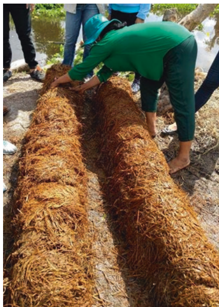
Fig. 6.5a Manual bedding

Rice straw or stubble can be used as bedding materials or substrates. These materials collected from the field must be sun-dried. If bundled substrates are used as bedding, the straw should be cut into 30-cm long strips to make bundles 10 cm in diameter. The beds can be created manually (Fig. 6.5a) or using a