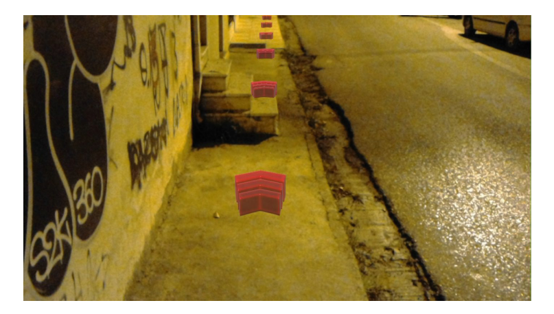
Fig. 1. Virtual arrows augmented the physical space and guided the users to their destination.