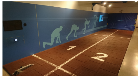
Fig. 1. Mapping of accessibility indicators to exhibit areas (left), and the exhibit “Running track” (right)