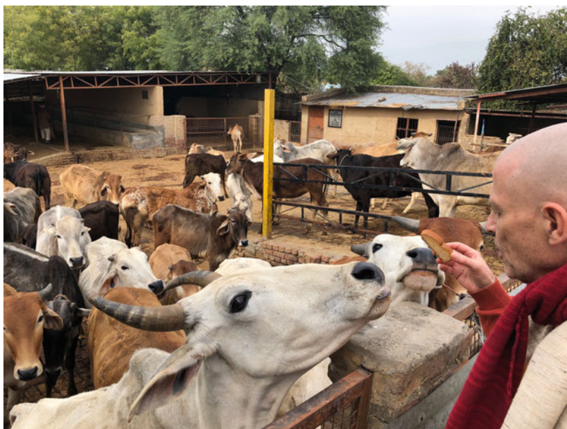
Fig. 4.1 The author offers a snack to rescued cows at Care For Cows, Vrindavan

international supporters feel encouraged that they are benefited by serving Krishna’s cows, even if indirectly, from a distance. 31 As in Pathmeda, regular donors may “adopt” a specific cow, enabling them to experience a sense of connection with a particular bovine, to receive news about it, and when visiting Vrindavan, to directly meet and interact with their adoptees. 32 Donors have also been recognized in the (currently discontinued) monthly newsletter. However, a good number of visitors may give