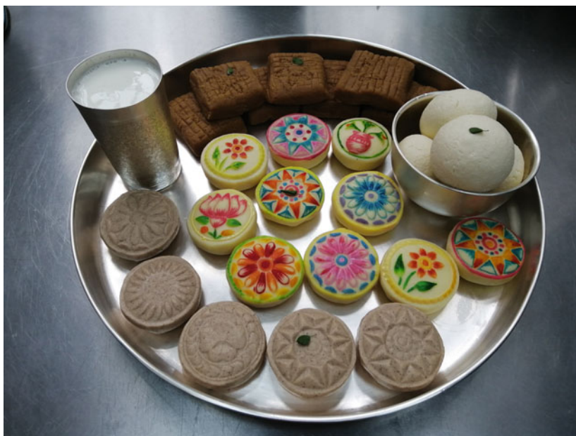
Fig. 4.2 Artfully prepared dairy sweets and hot milk for Krishna’s daily early morning snack, at Bhaktivedanta Manor, near London

liter of high-quality ghee, 45 an indicator of how highly ghee is valued. Ghee is valued for three areas of use, namely for ritual purposes (especially for making ghee oblations into a sacred fire); for cooking—both for deep-frying and for sautéing; and for medical purposes, especially as a component of Ayurvedic medicines. 46 Because ghee can be stored for long periods and can be easily transported, it has long functioned in India as the main end-product of milk (Rangarajan 1992, p. 82).