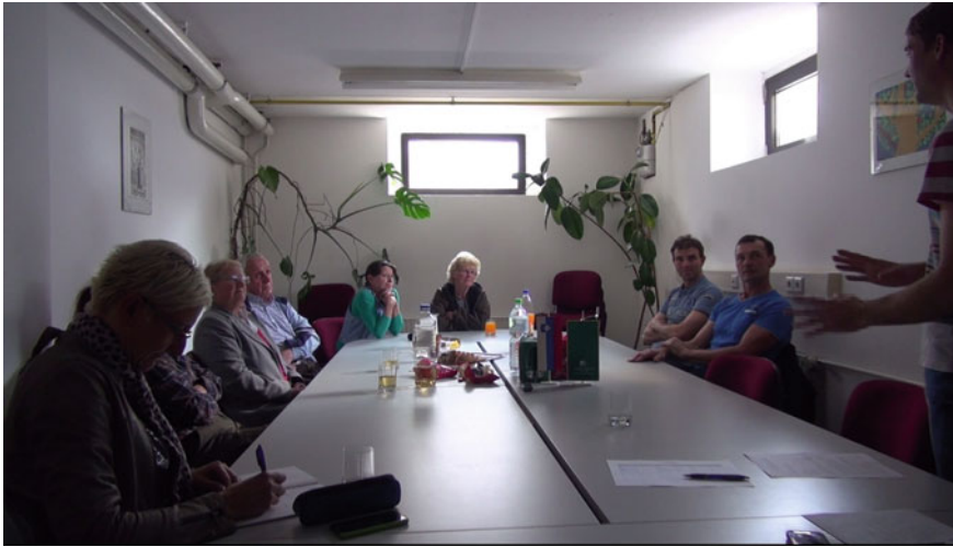
Fig. 13.2 Snapshot from a focus group in Velesovo.

challenge. The group structure plays a role in this respect. Well-structured groups tend to answer a research question in a straightforward way, whereas less structured ones help reveal the perspectives of the group participants and may assist in the discovery of new ideas and insights (Morgan 1988). In our case, the moderator fostered spontaneous and free-flowing conversation, thereby allowing relatively unstructured discussions (Fig. 13.2).