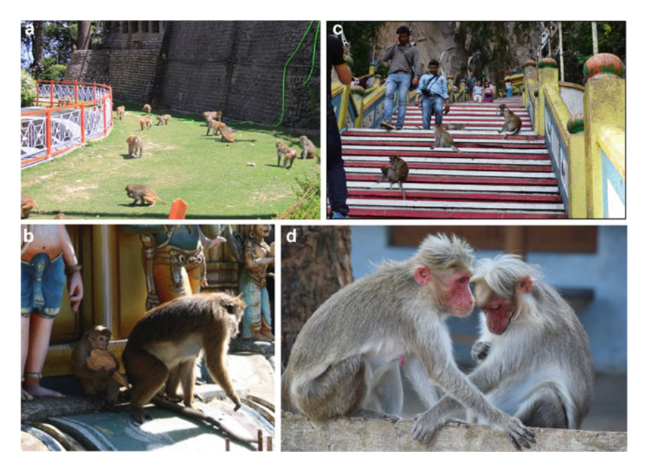
Fig. 13.1 Macaques at human-macaque interfaces, specifically (a) rhesus macaques in Himachal Pradesh, Northern India; (b) long-tailed macaques in Kuala Lumpur, Malaysia; (c) toque macaques in Colombo, Sri Lanka; (d) bonnet macaques in Kerala, Southern India.

crested macaques: Balasubramaniam et al. 2012; Thierry et al. 2008; Sueur et al. 2011a).