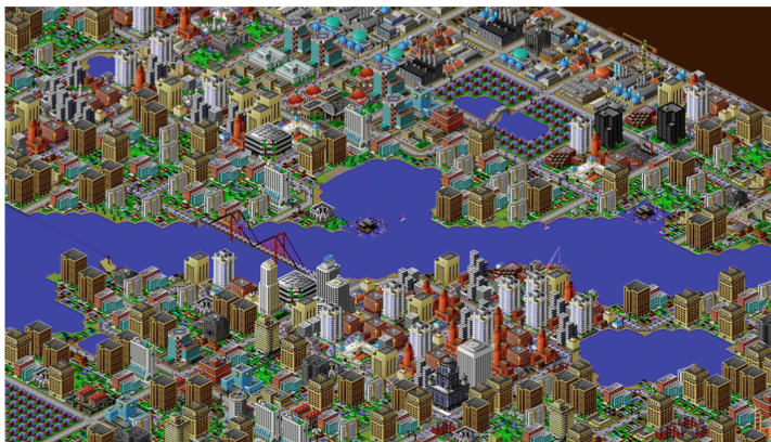
Fig. 3. SimCity 2000. EA games