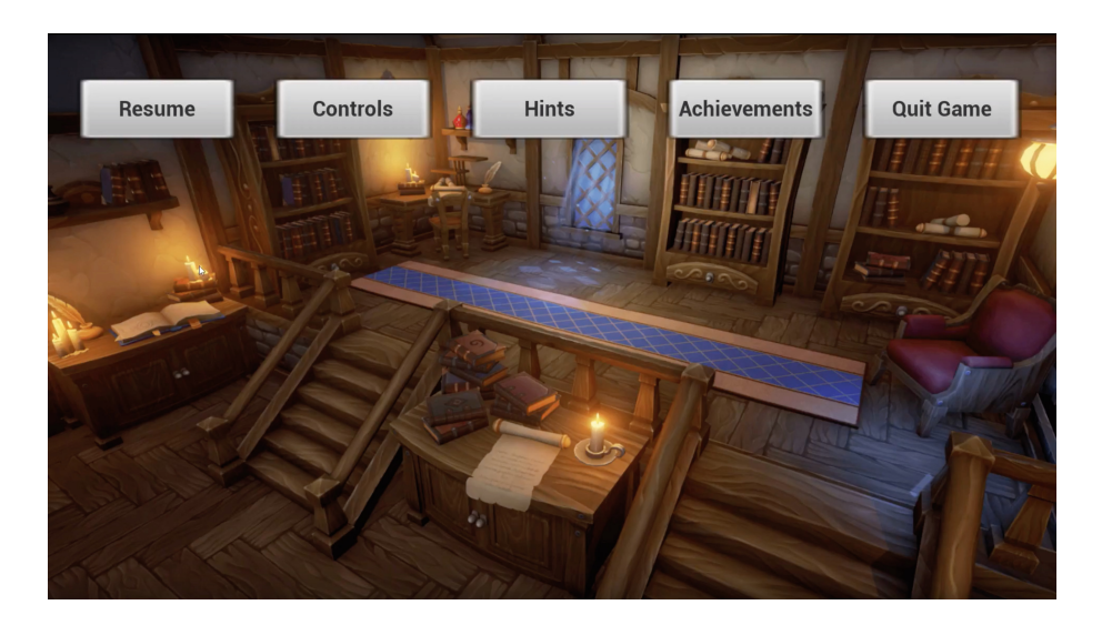
Fig. 7. Menu system

The game contains a simple menu system with a total of five buttons: Resume, Controls, Hints, Achievements, Quit Game (See Fig. 7). Resume and Quit Game are a single action buttons that allow the player to go back into the game or quit the game respectively. Controls, Hints and Achievements are a single screen options that displays the information of each menu respectively. We designed the menu system with the same style as the controls, by keeping the options to a minimum the user experience is enhanced, specially to a first a time player.