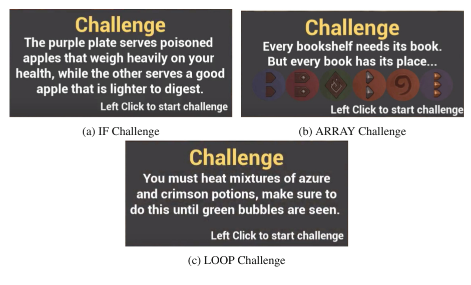
Fig. 3. Room challenge legends

Each room is equipped with a legend that aims to guide the player into solving the puzzle (See Fig. 3). The script on each room is cryptic enough to bring a challenge into the puzzle but not to the level of making the puzzle unsolvable. In case that the player feels the need of help, the system is also equipped with a help sub-menu that elaborates into the hint given at first. There is not a limit to the amount of times each puzzle can be tried. We are not looking for performance or efficiency, just for the experience.