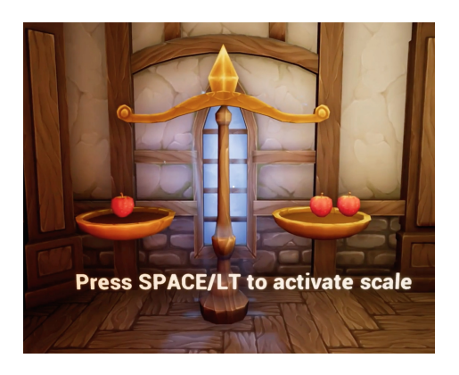
Fig. 5. Scale - used to solve first puzzle

On the first part of the puzzle, the player needs to move around the room and look for the apple that weights the most from the bunch (See Fig. 3a). There is a total of seven apples in the room but only one weights more than the others. The room has an old scale that the user can utilize to solve the puzzle (See Fig. 5). Once the apple is found, the player needs to set the apple on top of the purple plate. After completing both steps the first door opens giving access to the second room.