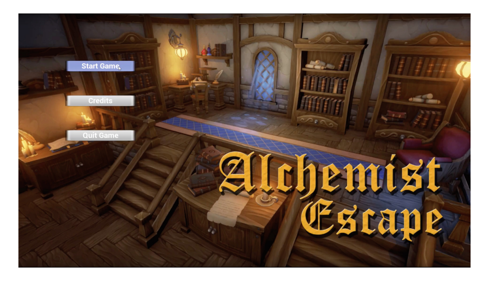
Fig. 1. Alchemist Escape - main screen screenshot

We developed a video game in the style of a escape room. Every game rewards the players efforts by providing some type of incentive. Alchemist Escape features a total of three different rooms. The player needs to solve a different kind of puzzle in each room, not only to proceed but also to finally reach the final room and to be able to finish the game. The concept of an escape room was adapted due to the popularity of it. Moreover, the urge to escape a room provides a better setting for problem solving and decision making [20] (Fig. 1).