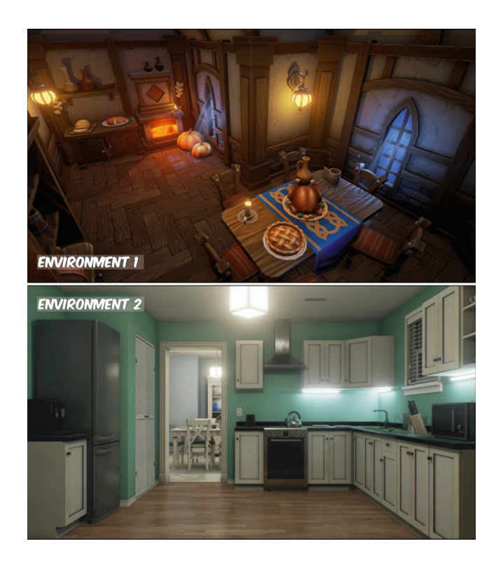
Fig. 2. Surveyed scenarios

Prior to developing the game, a small survey was conducted to decide the proper theme for the game. The survey showed two different possible scenarios to be played (See Fig. 2). Scenario A was a highly realistic environment that mimics a modern home. Scenario B was a less realistic yet still detailed home that also displayed "magical" scenery in a sci-fi setting. The results showed that people would opt to play a game with Scenario B over Scenario A. This results also reflect one of the reasons many players want to play video games and it is to escape reality and unwind from society [21].