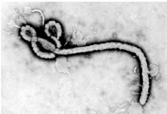
Fig. 1 Transmission electron micrograph showing some of the ultrastructural morphology displayed by an Ebola virus virion

Until 2014, the Ebola virus isolated sporadic outbreaks occurred only in Central Africa with counts numbering in the hundreds or less, and only lasting days to weeks. However, in March 2014 the WHO confirmed an epidemic of the Zaire species of Ebola virus emerging in West Africa. This outbreak lasted 2 years and grew to be one of the world's deadliest epidemics. There were 29,000 case and 11,000 fatalities documented by the World Health Organization (WHO).