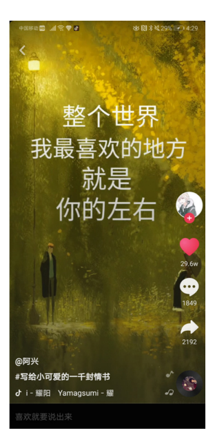
Fig. 1. User interface of Douyin (Tik Tok). Left: a video showing a dynamic wallpaper for mobile phones. Right: a video showing a love letter with narrations