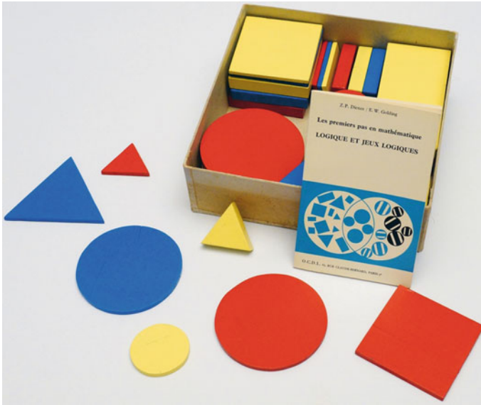
Fig. 3.4 A set of Logiblocks, 1968