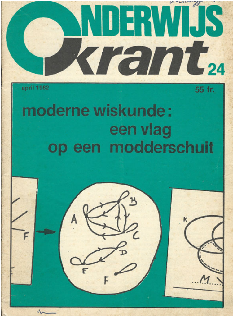
Fig. 3.5 Cover of the Onderwijskrant in which Feys' (1982) critique on New Math appeared (moderne wiskunde: een vlag op een modderschuit = modern mathematics: a flag on a mud barge)

first place ballast, “i.e. an enormous extension of the programs, concepts that were misunderstood, mechanical learning and pedantry” (ibid., p. 6). Moreover, it created an obstacle for the acquisition of traditional mathematics, which he described as “mathematical-intuitive and practice-oriented lower-level mathematics”. He further stated that “three-quarters of the reform involved the introduction of new terms and notations [...], a formal language primary-school teachers are unable to cope with and which complicated the application of mathematics” (ibid., p. 8). The pamphlet ended with a call for a large-scale counter-action, addressed to “teachers, parents,